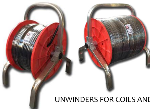
UNWINDERS FOR COILS AND BOBBINS