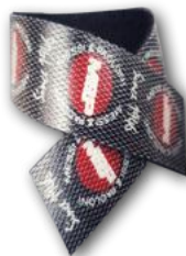
ADHESIVE REUSABLE VELCRO