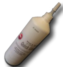
CABLE PULLING LUBRIFICANT