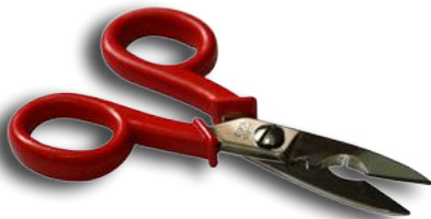
SPECIAL COAX SCISSORS